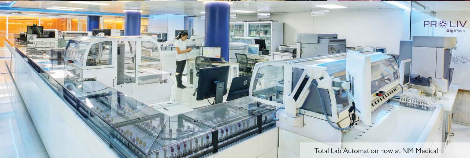
Total Lab Automation now at NM Medical